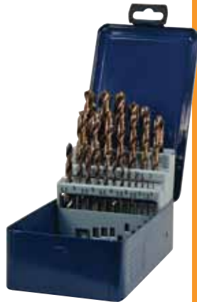
F 1.00 mm to 13.00 mm by 0.5 mm. 25 drill bits