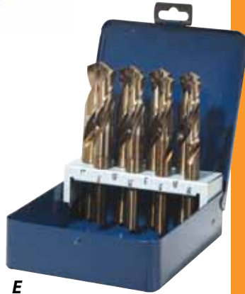
E \frac{1}{16} " to 1" by 16ths. 8 drill bits