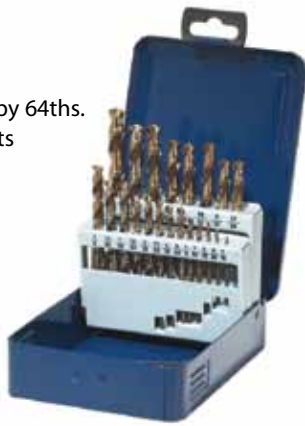
A \frac{1}{16} " to \frac{3}{8} " by 64ths. 21 drill bits