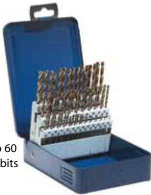
D No. 1 to 60 60 drill bits