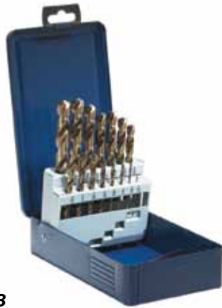
B \frac{1}{16} " to \frac{1}{2} " by 32nds. 15 drill bits